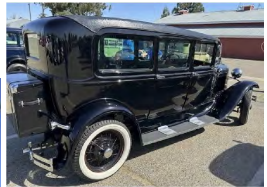
Anyone see what's different about this A ??? Originally a Tudor, it's been lengthened and had a couple more doors added! Cool!!!